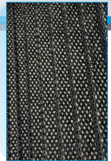
ROOM TEMPERATURE CATALYST