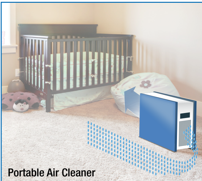
Portable Air Cleaner

Generally speaking, higher fan speeds and longer run times will increase the amount of air filtered. An air cleaner will filter less air if it is set at a lower speed. More air will pass through the filter at higher fan speeds, so typically filtration will be greater at higher fan speeds. Increasing the amount of time an air cleaner runs will also increase air filtration.